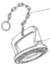
Blank cap with handle