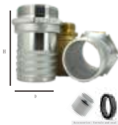
Male thread with helical shank