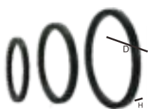
Gasket for guillemin