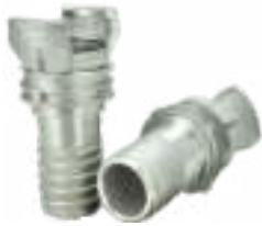
Guillemin with helical shank