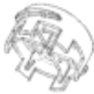
Cap without locking ring