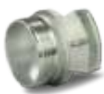
Male without locking ring