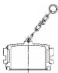
Guillemin cap with ring