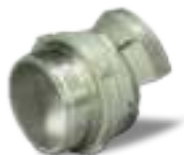
Male with locking ring