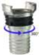
360° Swivel guillemin