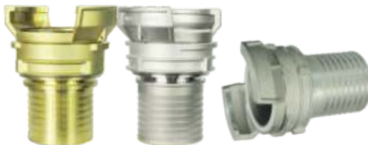
Hose end with collar